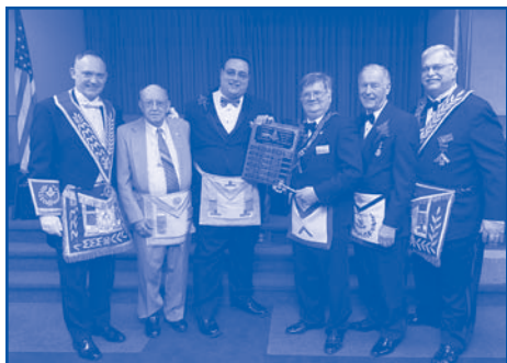
Canadians with traveling plaque and gavel