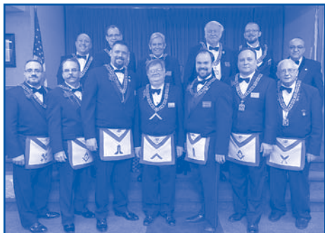
2017-2018 Barkley Officers