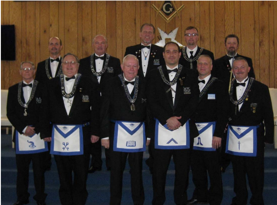
2016 STONINGTON OFFICERS